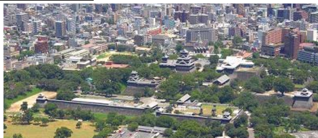
Kumamoto City, the host for the Asian-Pacific City Summit in 2013

Pohang City, Korea will host the 10 th Asian-Pacific City Summit (Mayors Conference) in 2012, and Kumamoto City, Japan will host the 11 th Asian-Pacific City Summit in 2013.