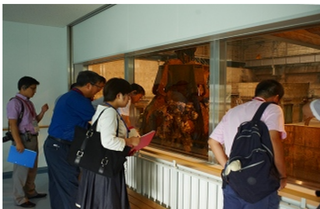
Participants were taking a serious look at the waste treatment process.

On the second day of the conference, we visited environmental facilities in Kagoshima City. Participants saw “North Waste Disposal Plant, a recycling facility which adopts latest pollution prevention technology, and “Kagoshima Museum of Environment”, a main facility for environmental education and recycling. They also attended a meeting with Kagoshima University and local high school students, who are creating art works by using empty cans. It was an extremely valuable experience for participants to have a firsthand experience of environmental facilities/measures, and to think about their cities’ policies. Representatives of participating cities highly appreciated the city tour as cases of Kagoshima would become helpful for their future policies.