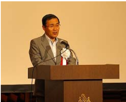
Opening remarks by Mayor of Kagoshima City