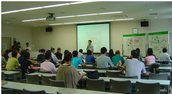
Briefing on the facility at North Waste Disposal Plant

On the second day of the conference, we visited environmental facilities in Kagoshima City. Participants saw “North Waste Disposal Plant, a recycling facility which adopts latest pollution prevention technology, and “Kagoshima Museum of Environment”, a main facility for environmental education and recycling. They also attended a meeting with Kagoshima University and local high school students, who are creating art works by using empty cans. It was an extremely valuable experience for participants to have a firsthand experience of environmental facilities/measures, and to think about their cities’ policies. Representatives of participating cities highly appreciated the city tour as cases of Kagoshima would become helpful for their future policies.