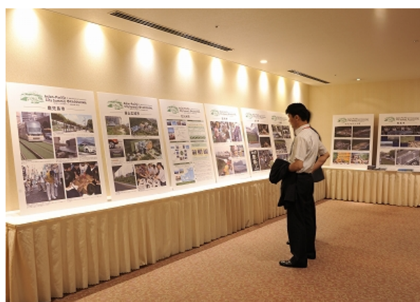
City Panel Exhibition outside the conference hall