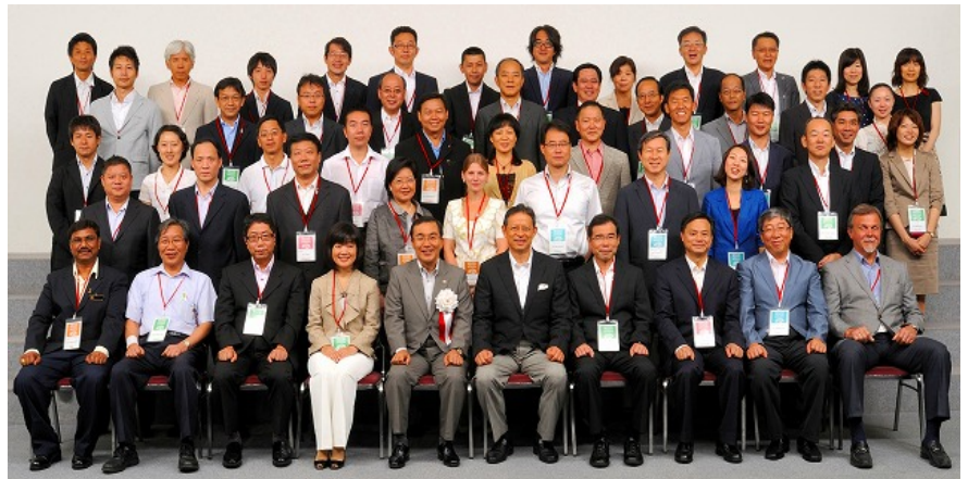
Group photo of participants

http://www.urc.or.jp/summit/en/practical/index.html