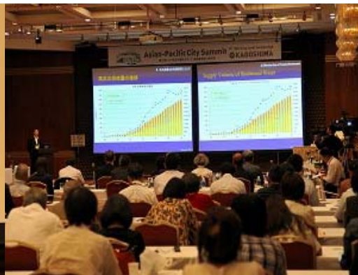
Each city presented their advanced environmental efforts.