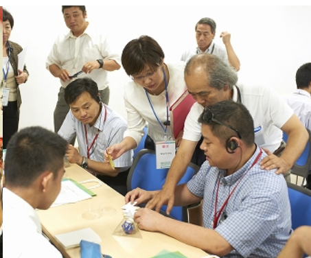
Participants received explanation of art works made of empty cans by Kagoshima University and local high school students.