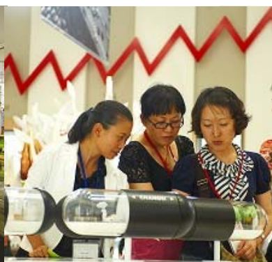
Overseas participants were taking close look at ingenious exhibits.