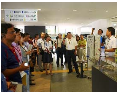
Brief on-sight lecture at the Kagoshima Museum of the environment