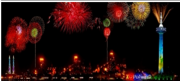
Pohang City, the host for the next Asian-Pacific City Summit in 2012