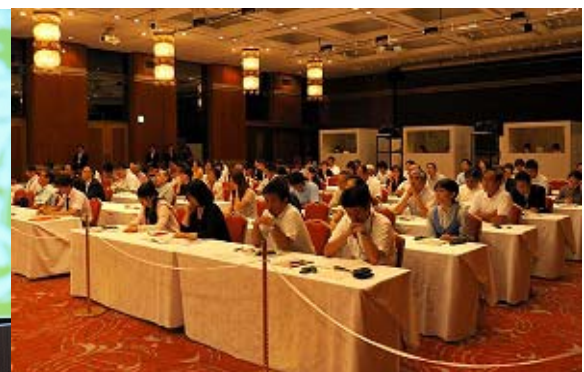
More than 120 citizens who are interested in environmental issues eagerly listened to each presentation.