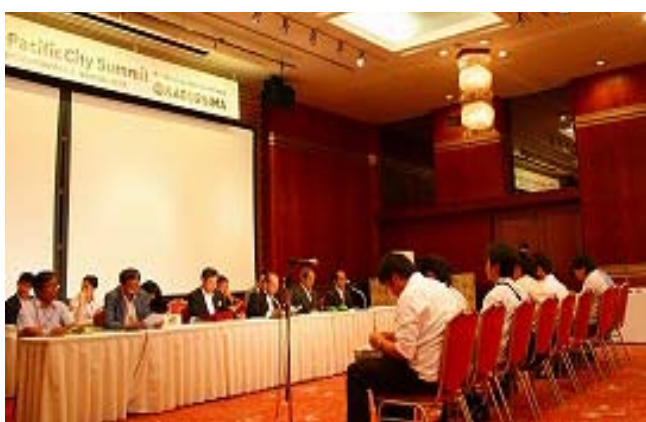
Joint Press Conference

After the conference, we had a press conference and TV and newspaper companies in Kagoshima City covered the conference. The 9 th Working-level Conference was reported in newspapers in prefectures in Kyushu Island.